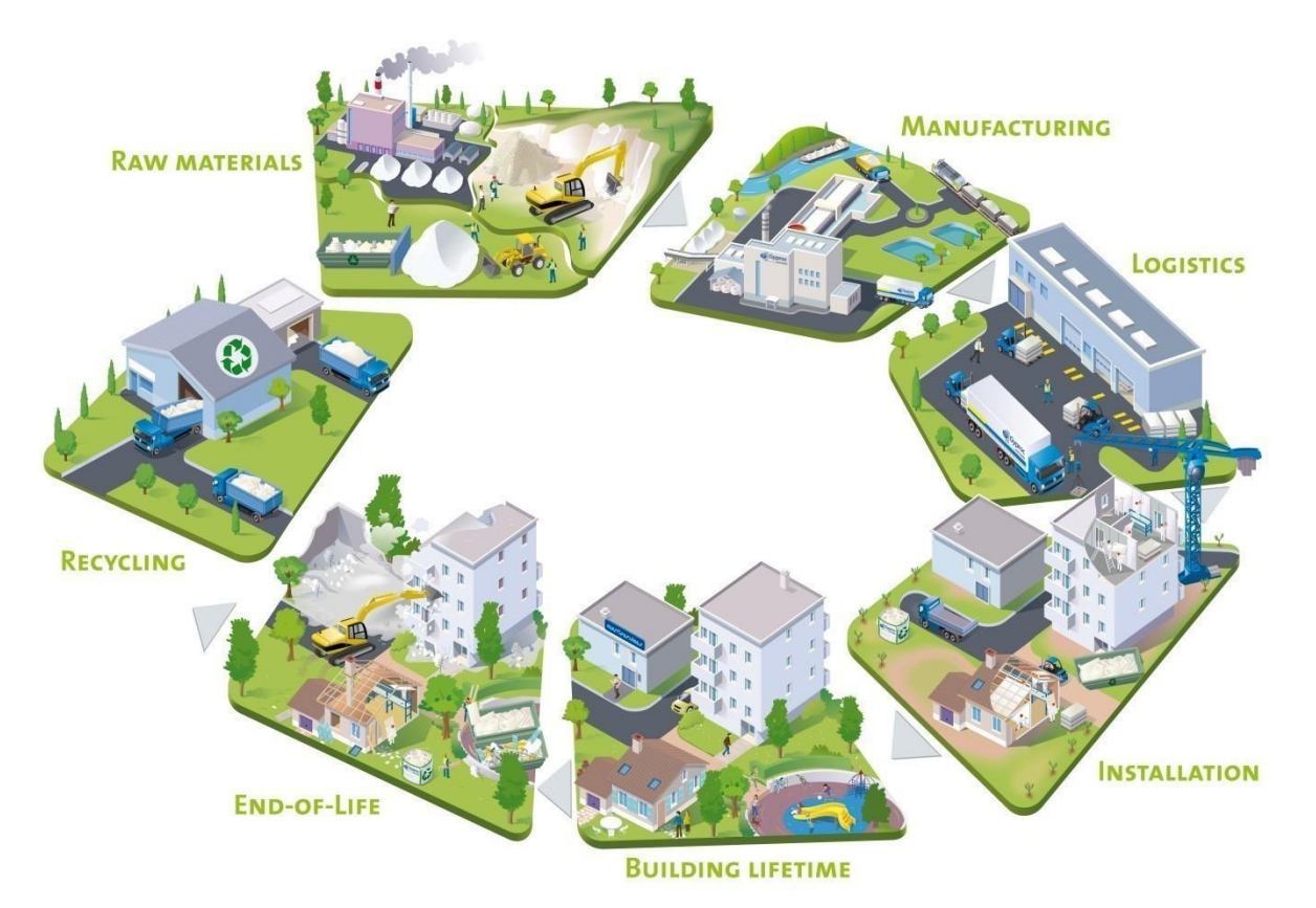
Figure 1: Flow diagram of the product life cycle. The process of the product life cycle is described below.